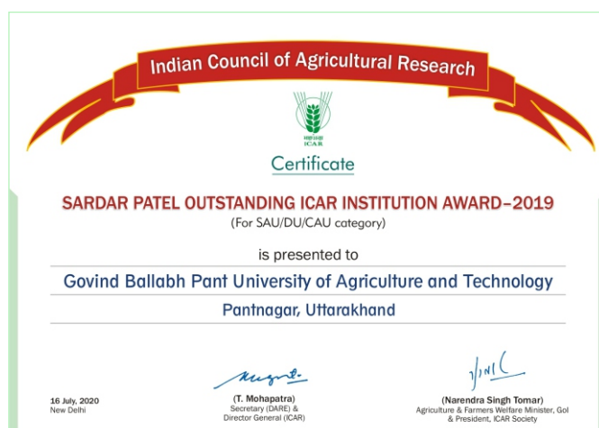
Certificate received for Best Agricultural University Award 2019